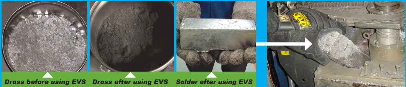
Dross before using EVS Dross after using EVS Solder after using EVS

SUPPORT: EVS International supports its product through 24-hour availability of spares and service and by partnering with quality distributors who all have TRAINED TECHNICIANS AND COMPREHENSIVE SPARES stockholding.