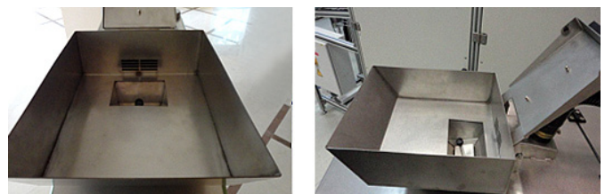
New loading tray increases the size of the loading area.